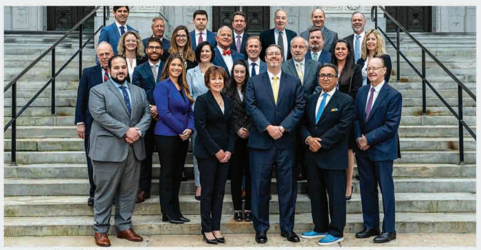
At BPS Lawyers, you get more than a lawyer. You get a law firm.

Glastonbury 2252 Main Street • 860-659-0700 Hartford 100 Pearl Street • 860-522-3343